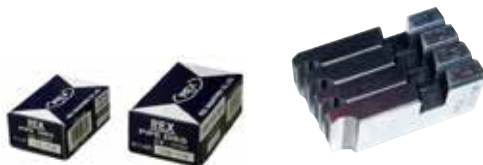
112R Dies 15A-20A 150007 114R Dies 15A-20A 151007