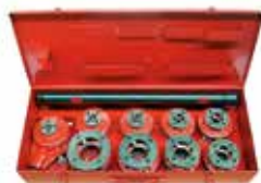
12R BSPT 112051*