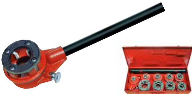
With 1 1/2" Drop Head

Rex Drop Heads and Dies are ideal for in-place threading from 1/8"- 2" and are designed to fit Rex Ratchet Handle 112162 (BSPT) / 112160 (NPT) as well as Wheeler Ratchet Handle 43310, and other models, such as 12R, 00-R, 111-R, 0-R, 30A & 31A, 600 & 700 Power Drives, DHR 12 Series Drop Heads and BT 40000 Series Drop Heads.