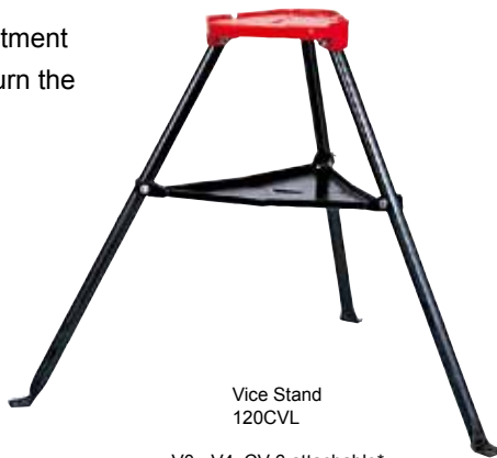
Vice Stand 120CVL V0 - V4, CV-6 attachable*