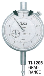
TI-1205 GRAD. 0.0001" RANGE 0.20"