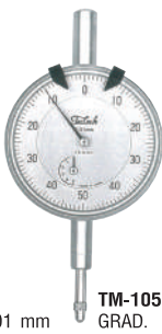
TM-105 GRAD. 0.01 mm RANGE 5 mm Symmetrical scale Shockproof Flat back