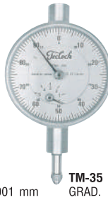
TM-35 GRAD. 0.01 mm RANGE 5 mm Shockproof