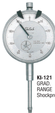
KI-121 GRAD. 0.001" RANGE 1" Shockproof