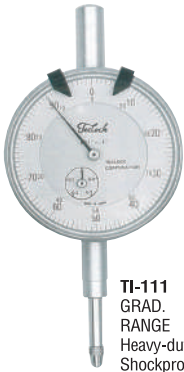
TI-111 GRAD. 0.001" RANGE 50" Heavy-duty type, Jeweled Type Shockproof