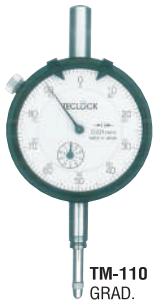
TM-110 GRAD. 0.01 mm RANGE 10 mm Shockproof