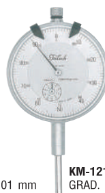
KM-121 GRAD. 0.01 mm RANGE 20 mm Shockproof